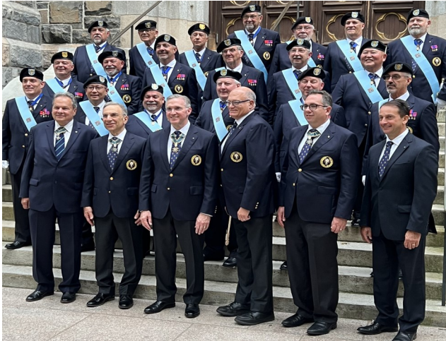
Class of VSM's Installed Sept 9, 2023 at St. Mary's Church. This event took place during the Supreme Assembly Meeting in New Haven Connecticut.

During the meeting VSM's received reports from the Supreme Secretary, Supreme Master and comment from the Deputy Supreme Knight. To see the Supreme Master Report Click Here .